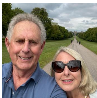
off to see the neighbours