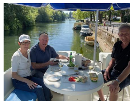
on the Thames