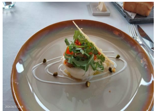
Not your average Changeover dessert