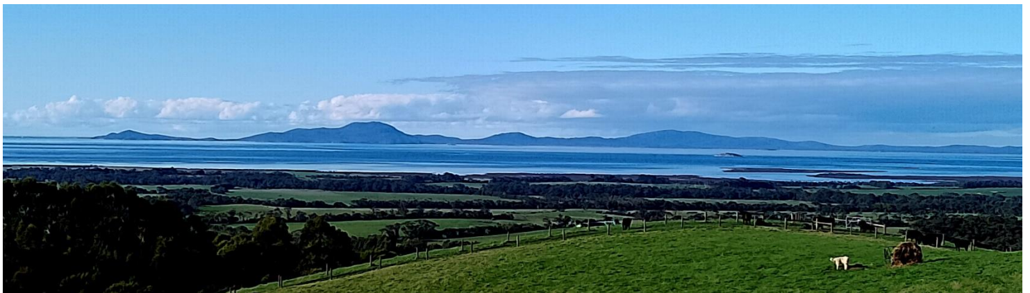
On the way to Rotary Club of Foster's Changeover Dinner