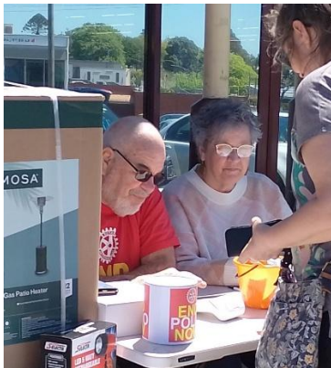
Selling tickets at COLES