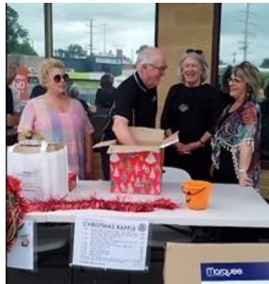
And the winner is!!!