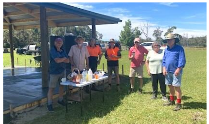
Lunch delivered to concreters at Drouin West