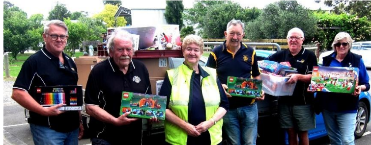
Drouin & Warragul members deliver toys to Longwarry