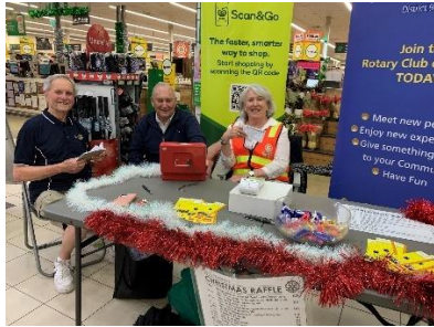
Ticket sales at outside Woolworths