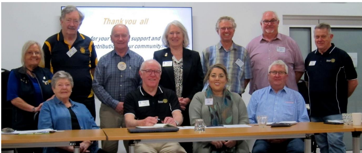
Presidents, Past Presidents, Presidents Elect and a couple of Secretaries from Warragul, Foster, Drouin, Wonthaggi, Leongatha and Inverloch clubs at the workshop. Phillip Island & San Remo, Trafalgar and Korumburra clubs not represented