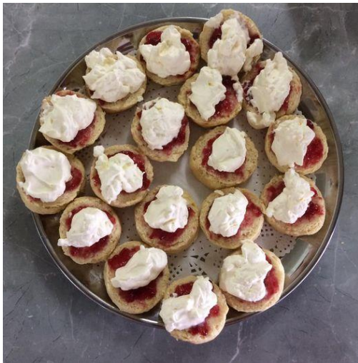
Plate of Scones cooked by Lorraine Kinrade OAM on 3 rd November 2019 for the Mixed Precision Pairs at the Drouin Bowling Club