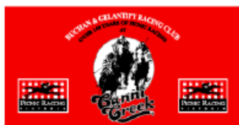
Buchan & Gelantipy Racing Club