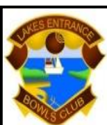
Lakes Entrance Bowls Club