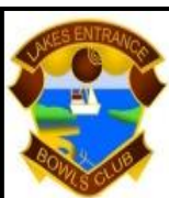
Lakes Entrance Bowls Club