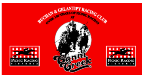
Buchan & Gelantipy Racing Club

Their support is crucial to the continued viability of our Club and, as such, they form an important part of our life in Lakes Entrance. For these reasons our members support these sponsors and encourage others to do the same.