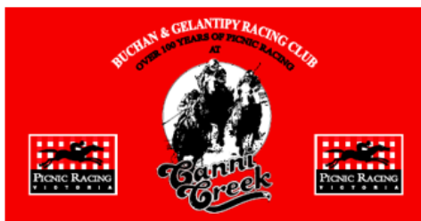
Buchan & Gelantipy Racing Club

Their support is crucial to the continued viability of our Club and, as such, they form an important part of our life in Lakes Entrance. For these reasons our members support these sponsors and encourage others to do the same.