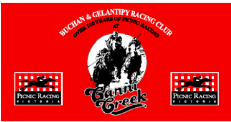
Buchan & Gelantipy Racing Club

Their support is crucial to the continued viability of our Club and, as such, they form an important part of our life in Lakes Entrance. For these reasons our members support these sponsors and encourage others to do the same.