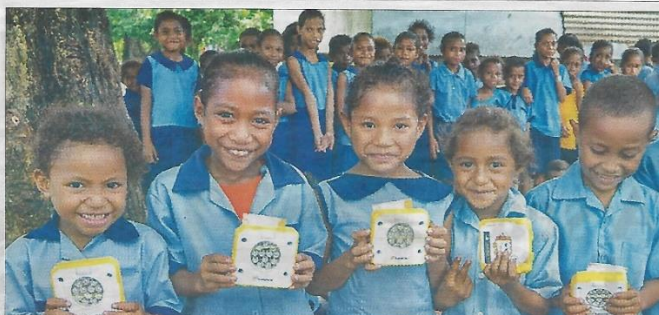
School students in Timor-Leste with their solar lights donated by local group East Gippsland Friends of Timor-Leste.