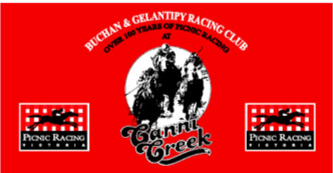
Buchan & Gelantipy Racing Club

Their support is crucial to the continued viability of our Club and, as such, they form an important part of our life in Lakes Entrance. For these reasons our members support these sponsors and encourage others to do the same.