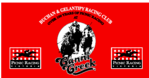
Buchan & Gelantipy Racing Club