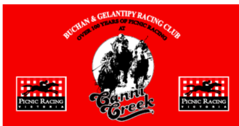
Buchan & Gelantipy Racing Club