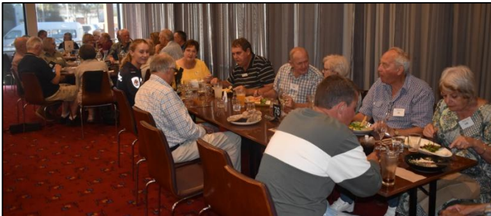
A great attendance for an important presentation