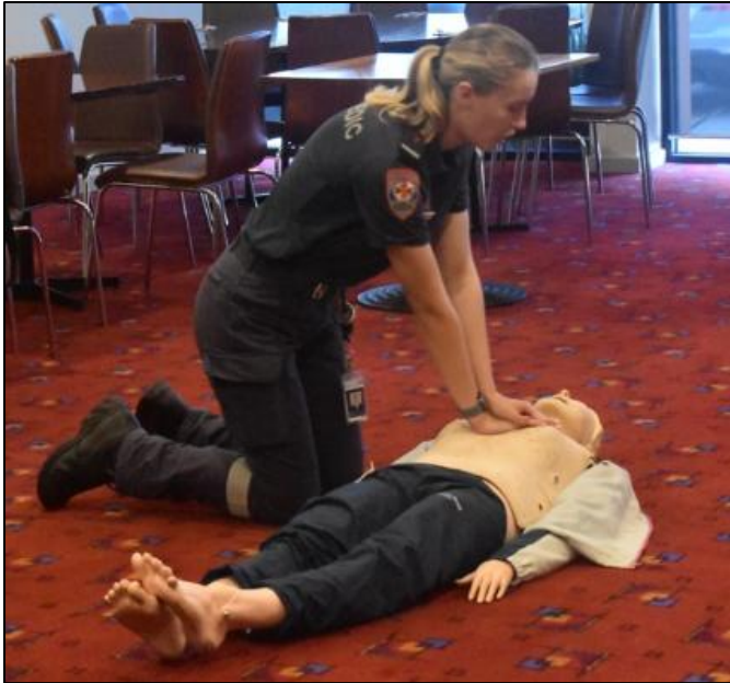
Standard treatment position with patient laying on a firm surface.