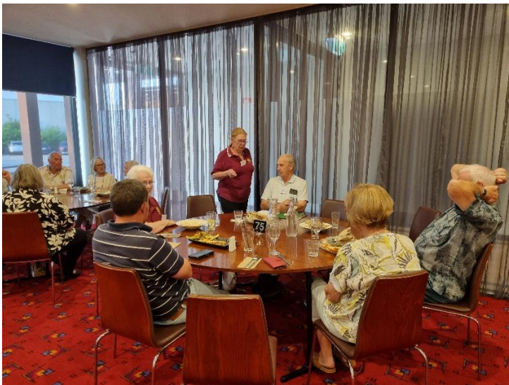
Wednesday Night Rotary (26 Feb 2025)