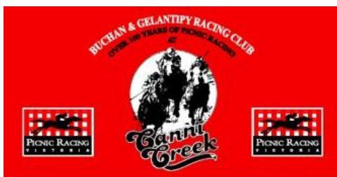
Buchan & Gelantipy Racing Club