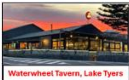
Waterwheel Tavern, Lake Tyers