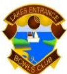
Lakes Entrance Bowls Club