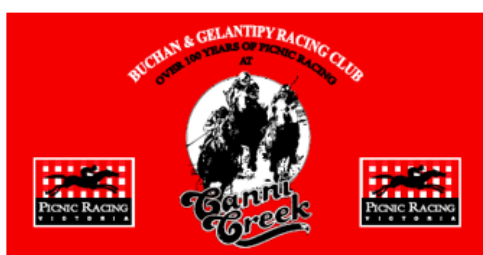
Buchan & Gelantipy Racing Club