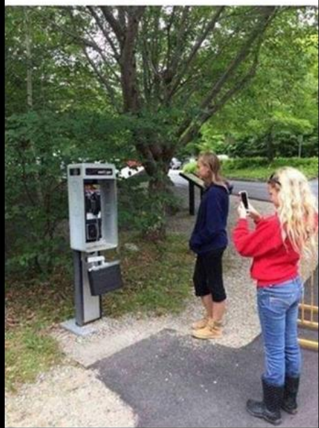
Kids exploring ancient ruins

All I'm saying is, at any point during that ride through the desert he could have given the horse a name.