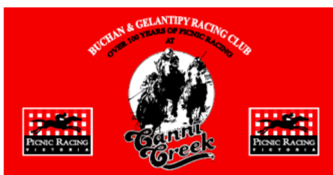
Buchan & Gelantipy Racing Club