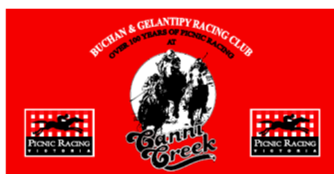
Buchan & Gelantipy Racing Club