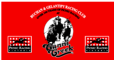
Buchan & Gelantipy Racing Club

Their support is crucial to the continued viability of our Club and, as such, they form an important part of our life in Lakes Entrance. For these reasons our members support these sponsors and encourage others to do the same.