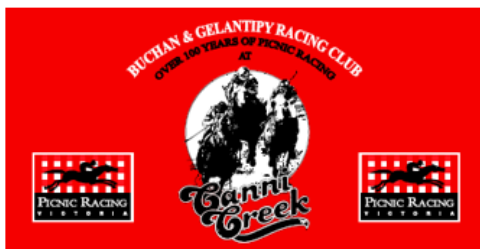
Bucha & Gelantipy Racing Club