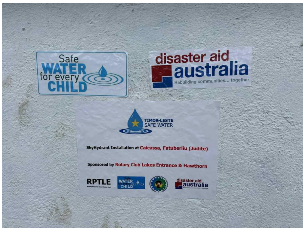
Sky Hydrant sign