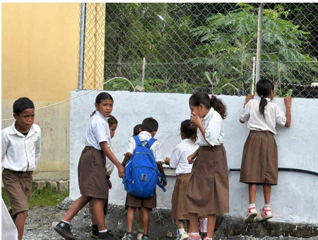
Children drinking at Sky Hydrant tap