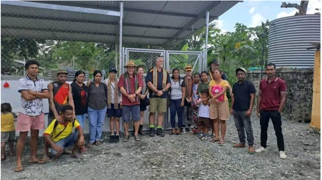
Sky Hydrant crew and helpers