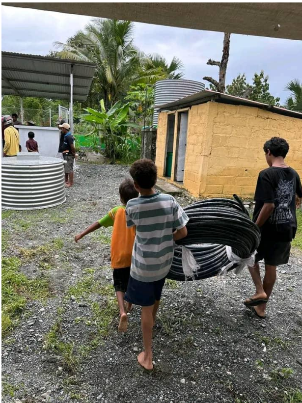
Sky Hydrant construction