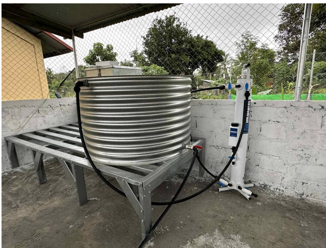
Sky Hydrant installed