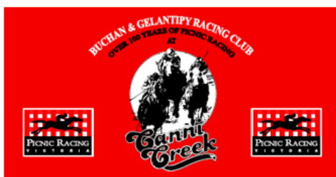
Buchan & Gelantipy Racing Club

Their support is crucial to the continued viability of our Club and, as such, they form an important part of our life in Lakes Entrance. For these reasons our members support these sponsors and encourage others to do the same.