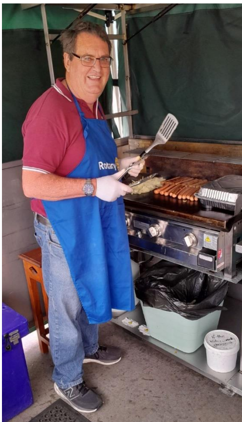
Stepping In To Assist At The Bunnings BBQ