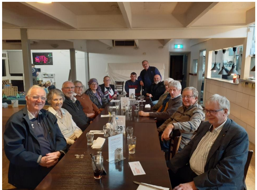
A night at the Kalimna Pub