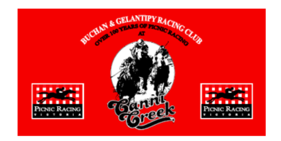
Buchan & Gelantipy Racing Club