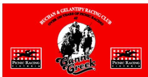
Buchan & Gelantipy Racing Club

Their support is crucial to the continued viability of our Club and, as such, they form an important part of our life in Lakes Entrance. For these reasons our members support these sponsors and encourage others to do the same.