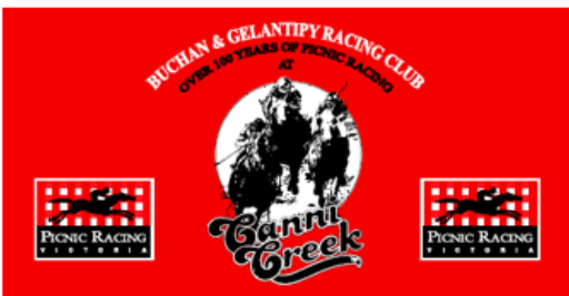
Buchan & Gelantipy Racing Club