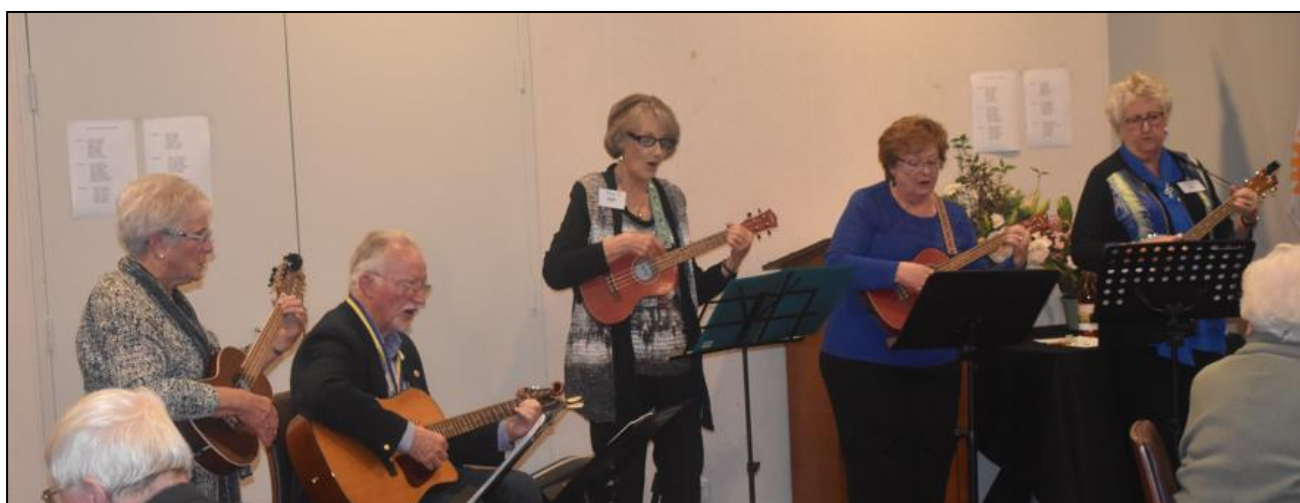
We were entertained with music and song by our own Club musicians