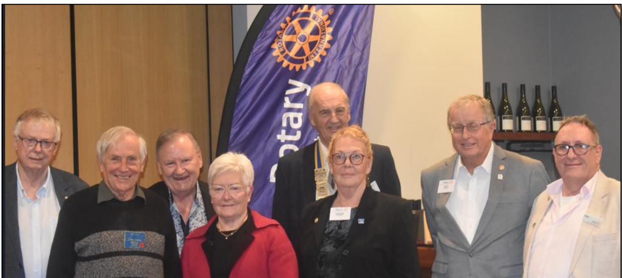
Members of the Board for 2025 2026