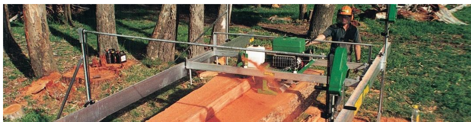
The Lucas Mill in operation

After wrestling with Council building estimate costs for two years we were successful in receiving a Federal Government Strengthening Communities Grant of $15k, and a further Council Grant of $5k, in addition to a previous $5k. With member approval of $20k from Club funds, we now have the necessary $45k and will hopefully see construction commence in the next few months.