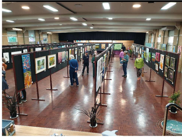
Rotary Art Sales in conjunction with Baw Baw Arts Alliance.