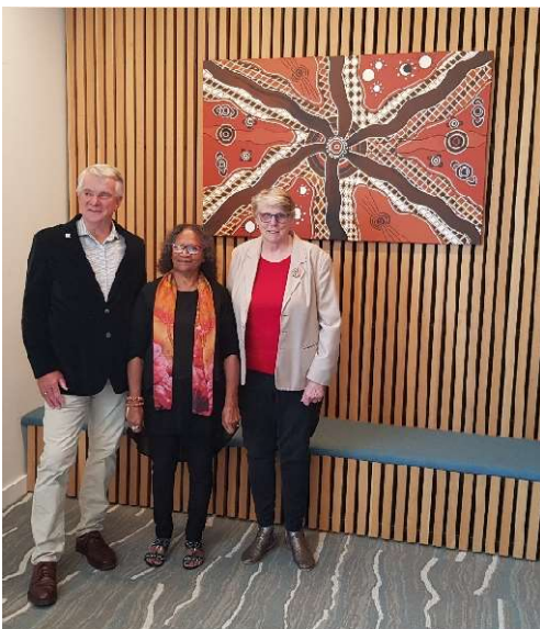
Art from the Air.

And to finish, here are some of our projects: