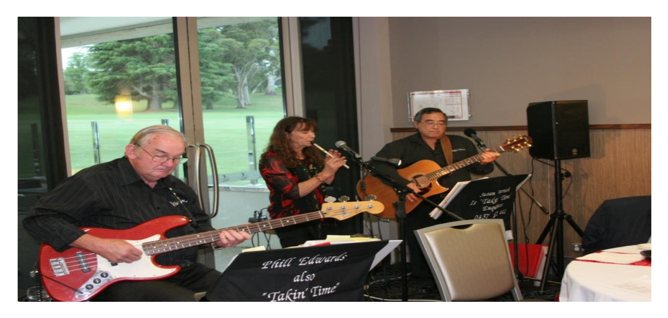
Special Social evenings; Christmas Meeting 2018