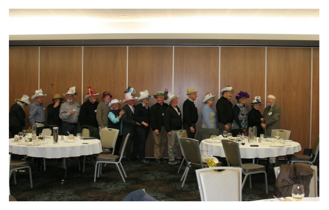
Special Rotary Mental Health, evening May 2019, a Congo Line of hat exhibits, preparing for the hat judgement presentation.