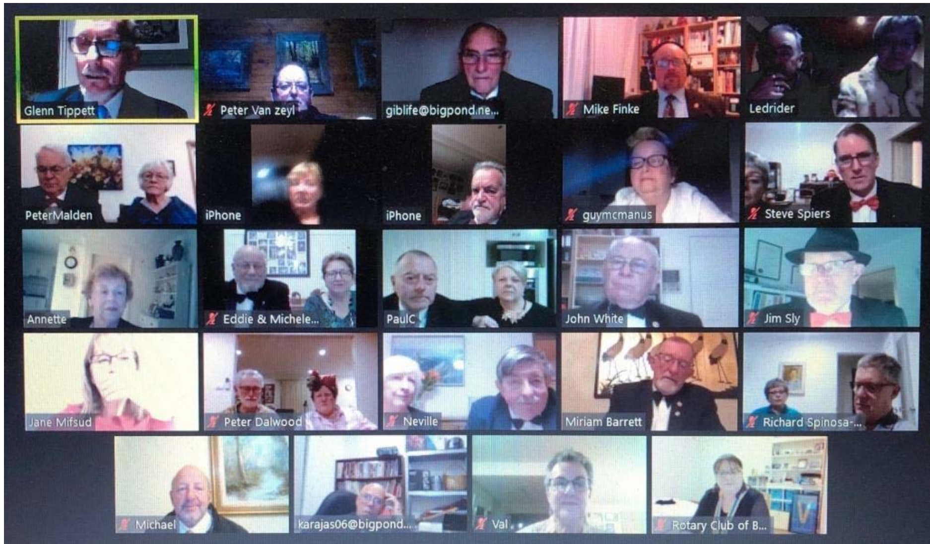
Rotary Club of Boronia Members and Partners present at Club Changeover Meeting – 23 rd June 2020