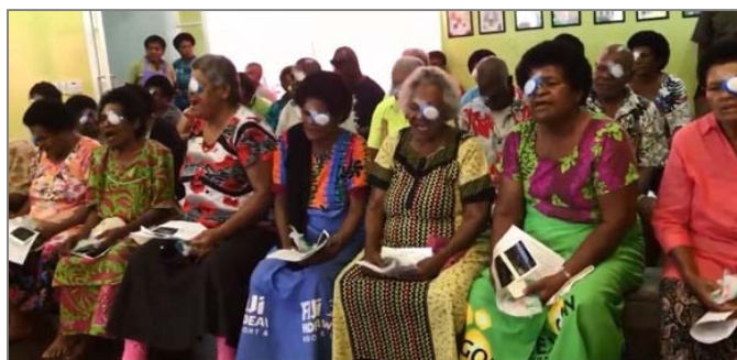
Patients wait for their eyes to be examined the day after their surgery