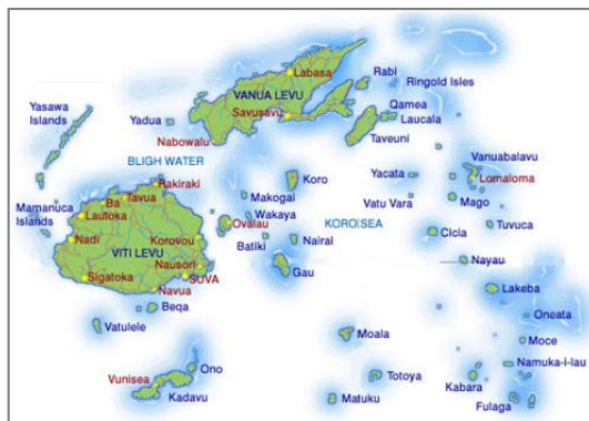
Fiji Group of Islands