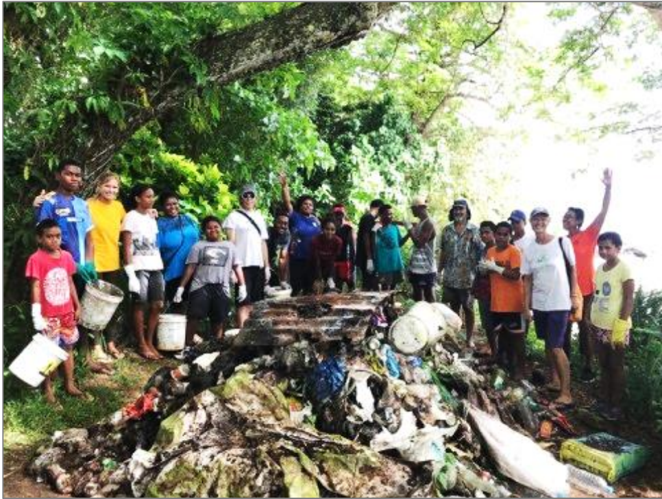
Prince Charles Beach Clean-up – workers and the pile of rubbish collected