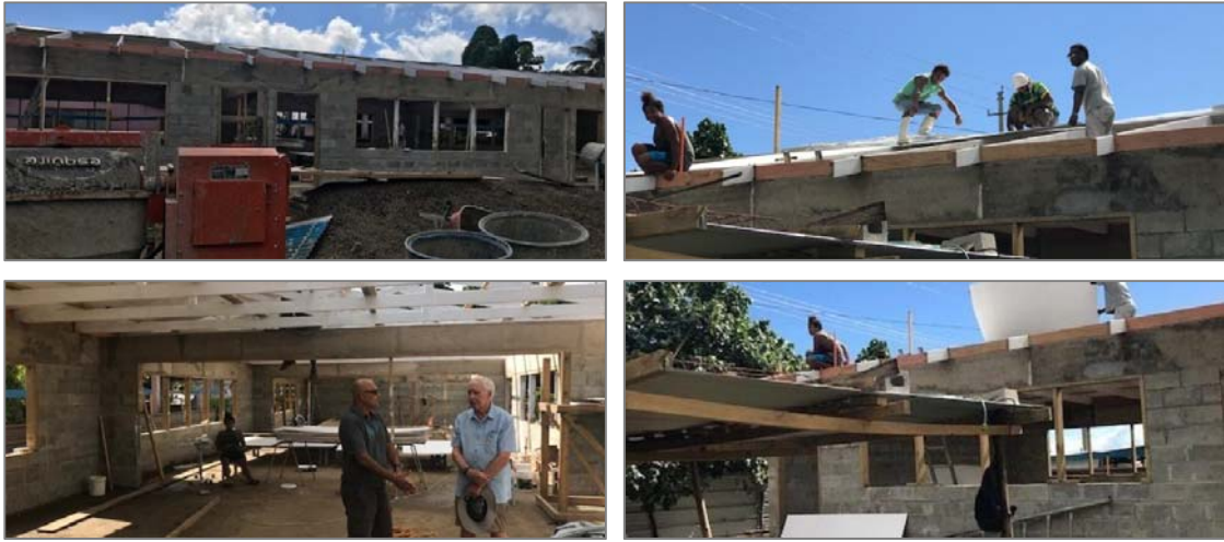
Naqara Primary School – four classrooms under construction as reported last year

In all, there are twelve primary schools and four secondary schools on the island. Naqara Central has classes for levels 1-8, with two classes per level. There are at least 30 students per class.