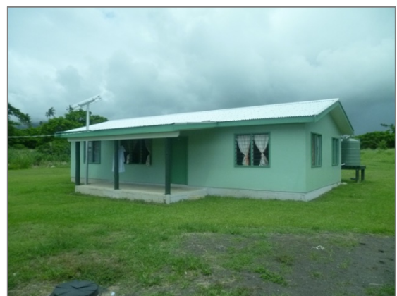
Four-bedroom Teachers Quarters