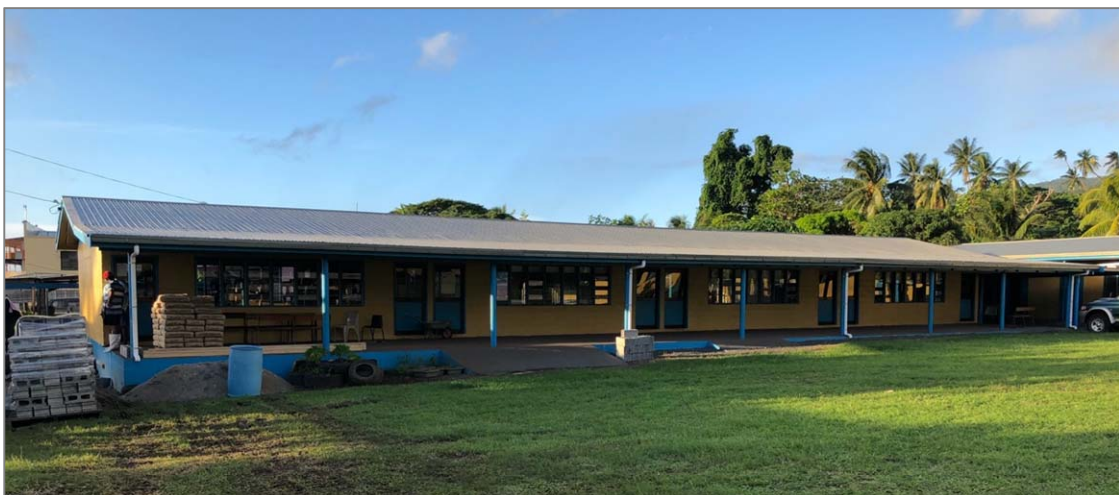
The classrooms were completed early in the Rotary year

The Rotary Club of Taveuni Island is managing construction of the houses and school classrooms using a grant provided by the New Zealand Ministry of Foreign Affairs and Trade in conjunction with Rotary New Zealand World Community Service.