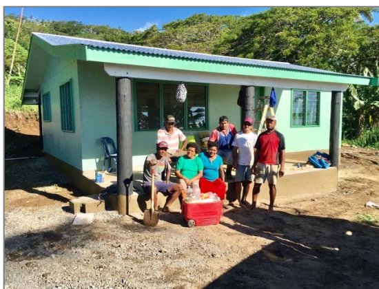
Two-bedroom Teachers Quarters

The Rotary Club of Taveuni Island has previously built nine 2-bedroom teachers' quarters and two 4-bedroom teachers' quarters with much assistance from RAWCS (Rotary Australia World Community Service), the Rotary Club of Boronia and our valuable supporters. This has all been previously reported, but is included here to show the total amount of school work completed.