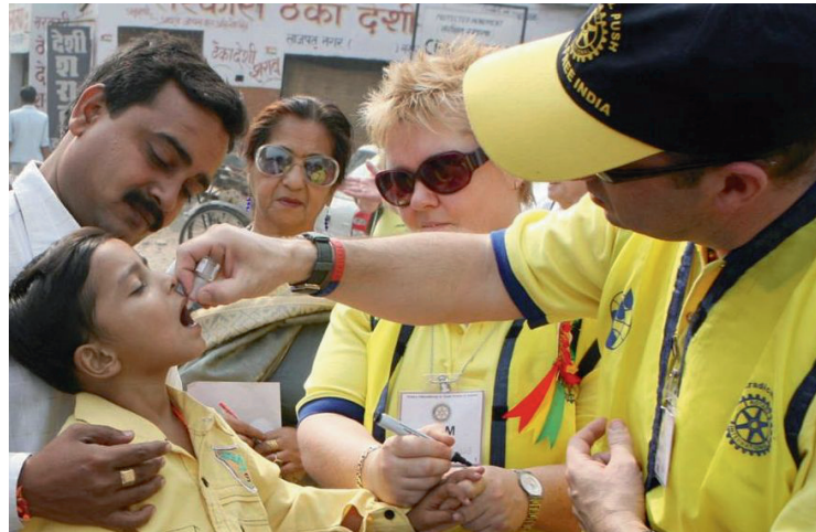
Volunteers helping on Rotary's "End Polio Now" project

You are most welcome to attend a Club meeting at no cost to see how we operate. Meetings run to a strict agenda and there is usually a guest speaker and you get a chance to catch up with colleagues over breakfast. We finish promptly at 8:30am so the rest of the day and your evenings are not affected.