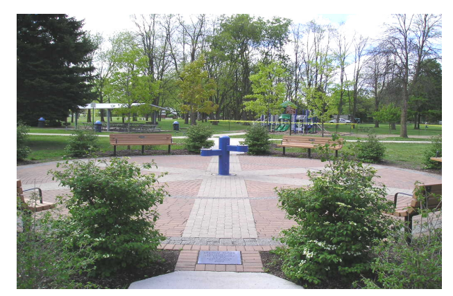
Fountain Plaza at Rotary Park

We have constructed and maintain several picnic pavilions, a 1/2 mile fitness track, playground equipment and a fountain plaza at Rotary Park. We sponsor a