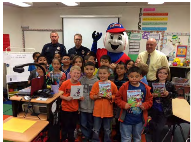
3rd grade students receive personalized book and support on making healthy and smart life choices.