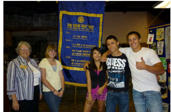
Students that attend leadership camp say it is life-changing. Rotary is helping to build our future workforce and community leaders.

The Club supported two students from local high schools to attend a one week leadership camp at the YMCA of the Rockies. The funding from the club was $1,350. The camp provides an opportunity for these students to learn leadership and team building skills. The students returned describing this opportunity as life-changing.