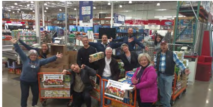
Rotary annual food drive donates $10,000 of food to local food banks.

Unfortunately, the food insecurity in our community is a real need, and our club communicates with the local food banks to be sure that we provide support with the items they need the most. In 2017, our Rotary District 5450 matched our budgeted amount. In addition, we received a $1,000 donation from Walmart, and expanded the collection points in both Northglenn and Thornton. With club member's donations, additional funding, and a major increase in food collection from the public, we estimate the food banks received a total of $10,000 in food items.