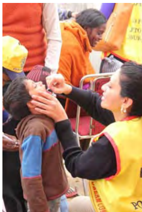
Child getting polio vaccination - Rotary eradicating Polio.

The Rotary Club of Northglenn was founded in 1968, one year before the City of Northglenn was chartered. The founding members had a dream of bringing the community together to provide service and support wherever it was needed.