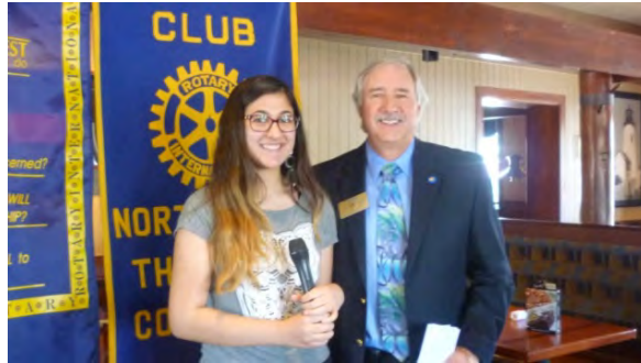
High School students recognized for their accomplishments and achievements weekly at Rotary. meetings.