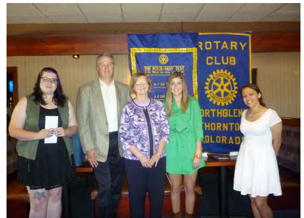
Scholarships presented to students to enhance their dreams for college.