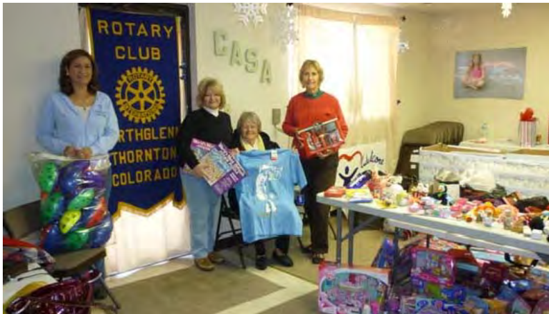
Christmas gifts for CASA teenagers, making their holiday's great.