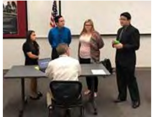
Rotary members advise and judge STEM students on school Problem Based Learning projects and evaluating career paths.