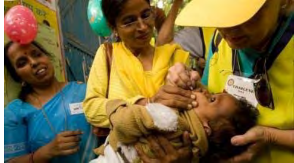
Child getting polio vaccination - Rotary eradicating Polio.