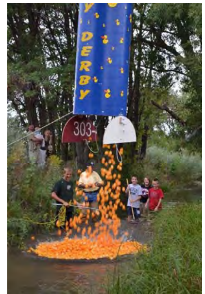
The Club raised $27,000 to reinvest into Rotary projects.

Local non-profits also assisted with ticket sales and received 40% of their sales to help their community- based programs. The event included a separate race for "corporate ducks" that are much larger and generates Enthusiasm from local businesses, and also offers opportunities for