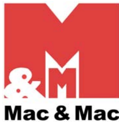
Mac & Mac