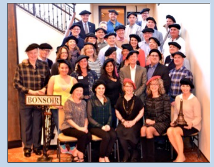
The 2014 Rendezvous in Paris Gala Team in April 2014

As co-chairs of this wonderfully fun and purposeful event, we have said time and again that this whole experience reflects the energy of our Club and the international theme, "Light Up Rotary." An entire French army of 91 people, working on 20 committees, used their personal and professional strengths to bring Rendezvous in Paris from dream to reality. This amazing team is a true reflection of "Service Above Self." They are the reason this gala broke attendance records! From seeking auction items and sponsors, to collecting and arranging what would look like a sea of Eiffel Towers and amazing