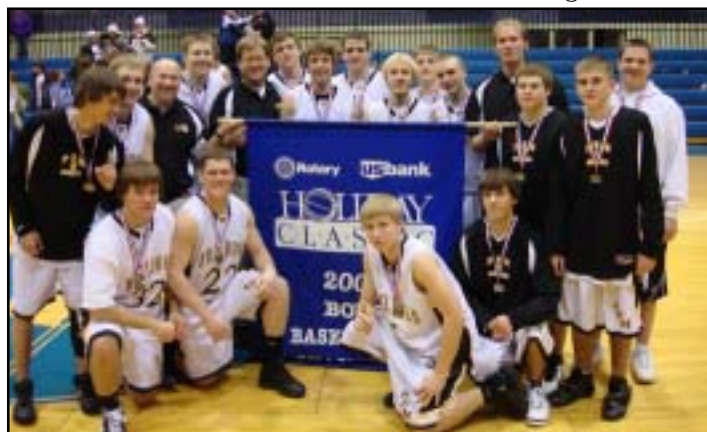
Plainview Elgin Millville