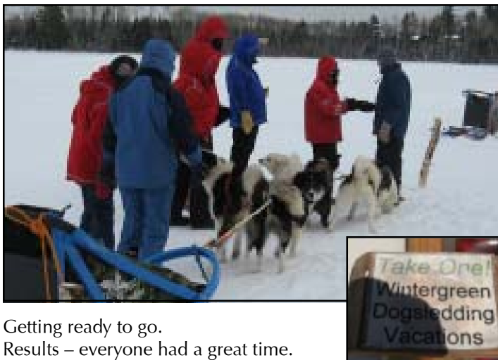
Getting ready to go. Results – everyone had a great time.

Continued from page 1 - Rotary Auction Outing