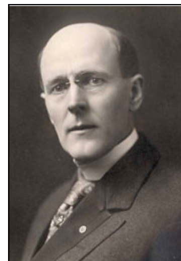
Paul Harris circa 1915.