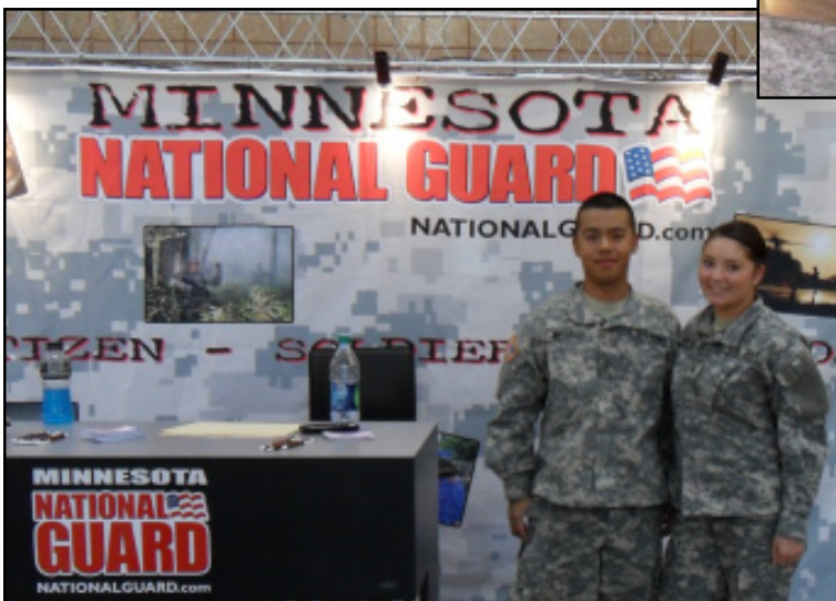
Members of the Minnesota Army National Guard greeting fans at the Rotary US Bank Holiday Classic.