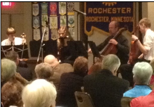
Rotarians enjoying our Holiday Luncheon entertainment.