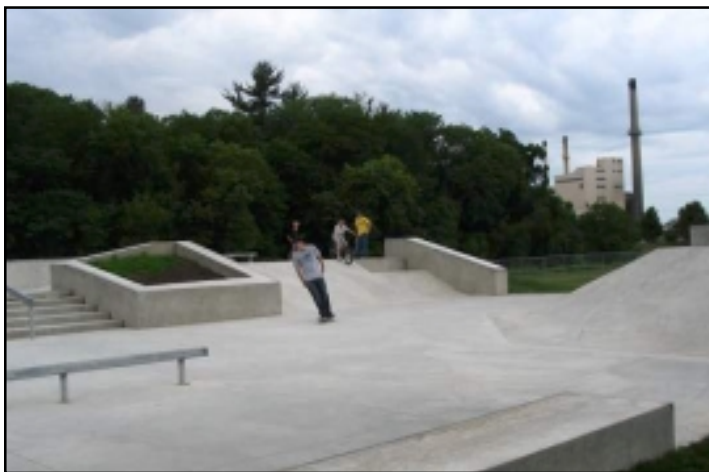
A skateboarder gives the new skate park, near Silver Lake Park, a try.