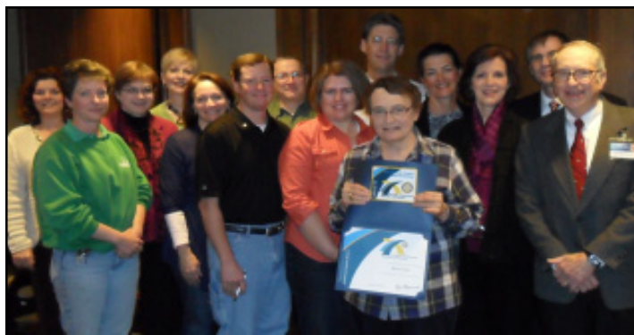
TRCR Board of Directors with Rotary Presidential Citation.

to partner with clubs in other countries and on different continents to make the world a better place to live with improved opportunity for world understanding, good will and peace.” In testament to the ongoing initiatives of the Rotary Club of Rochester to Rotary International’s programs and priorities, we were awarded a Presidential Citation with the special commendation, “With Distinction.” This