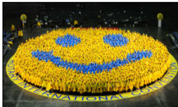
Rotary International Conference 2012, Rotarians gather together to create "Thailand's Smile."