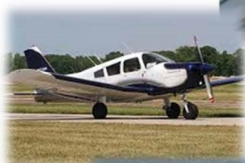
Piper Cherokee 150