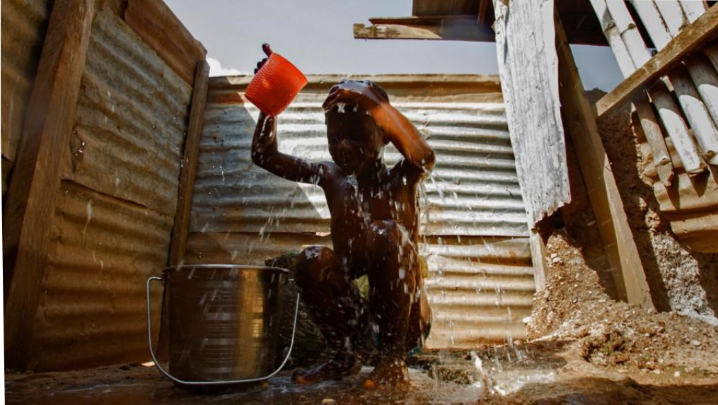
A young girl takes a bath using a single gallon of clean water.

Rotary and USAID both bring unique strengths to the effort. Rotary's global network of members raise money and oversee construction of the improvements. USAID provides the technical support to design and carry out the initiatives, and works to build the capacity of local, district, and regional agencies to operate and maintain the systems and oversee education and training.