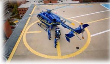
Mayo 1 (if available)

Thank you to the following organizations for their generous assistance with this event: