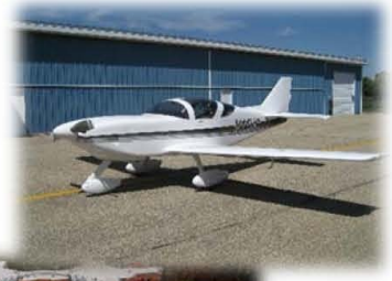
Glasair Super II-S