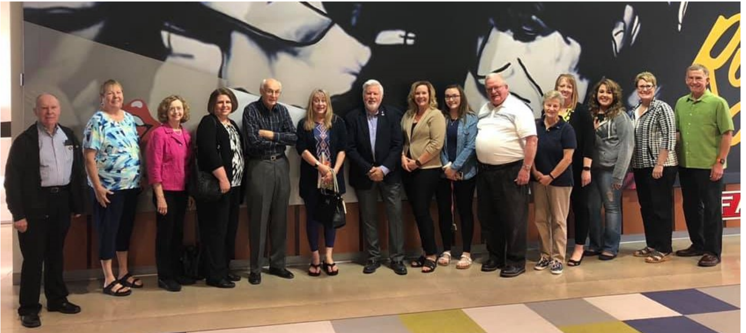
BOTTOM: TRCR members visit Fairway Outdoor