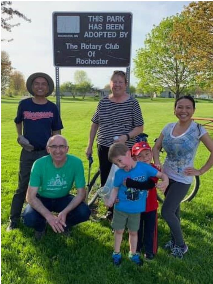
May volunteers at White Oaks Park cleanup. Join the crew on June 19.