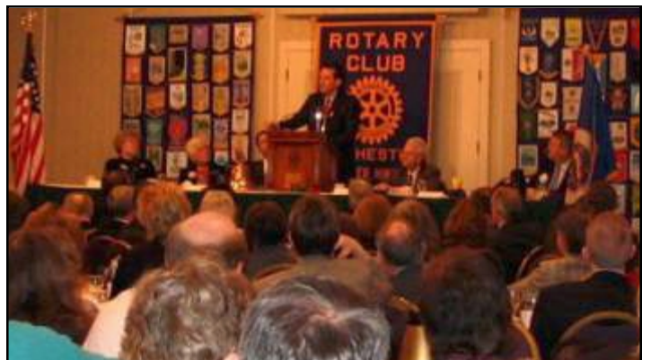
More than 250 Rotarians and guests were in attendance when Governor Tim Pawlenty spoke at our meeting on February 9.